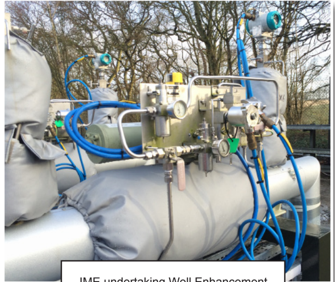
IME undertaking Well Enhancement Project for HGEL 2012 – 2013