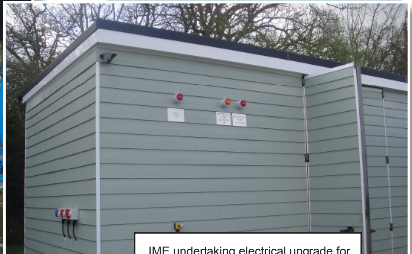
IME undertaking electrical upgrade for IGAS Ltd at Larkwhistle Farm 2012