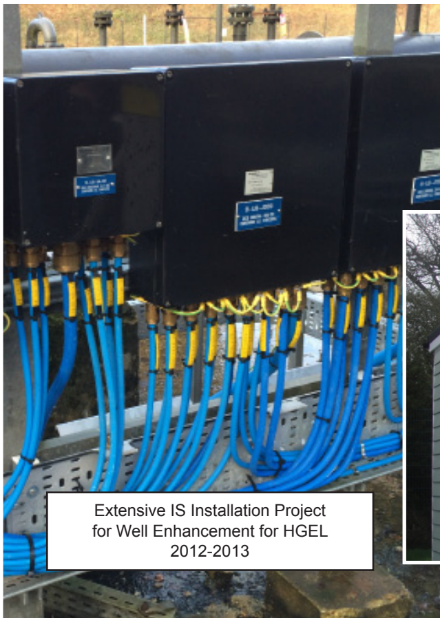
Extensive IS Installation Project for Well Enhancement for HGEL 2012-2013